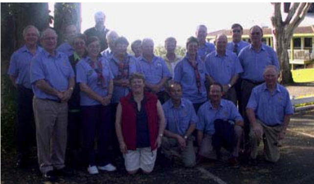
The NZ Touring Party