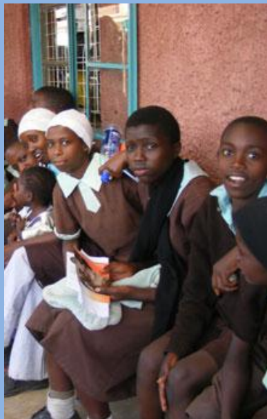
Families wait in line to get tested during a Rotarians for Fighting AIDS event in Kenya.

"Just like in the case of NIDs, Rotarians are mobilizing communities into