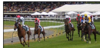
The Canberra Cup at Thoroughbred Park, and the winners were: Woden Rotary!