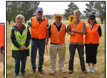
What a (parking) team.