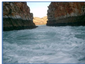
Water gushing through the Horizontal Falls at change of tide.

Another memorable journey was the overnight trip to the Horizontal Falls at Talbot Bay. Flying in a seaplane from Derby they saw wonderful scenery. They also travelled on a banana boat through the gap of the horizontal tidal waterfall in shark and