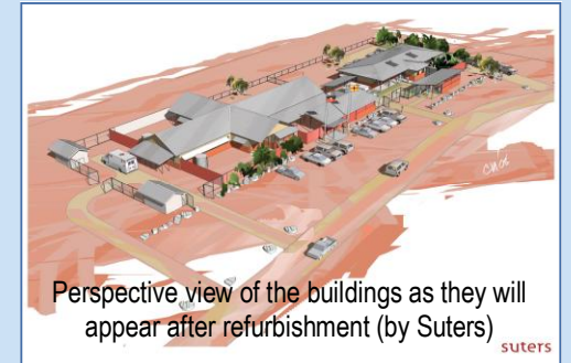
Perspective view of the buildings as they will appear after refurbishment (by Suters)

The joint meeting was to engage with Canberra City Club and request their assistance in money and physical labour.