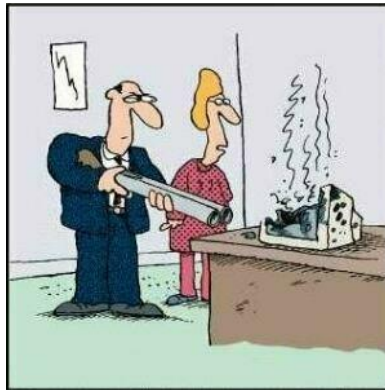
"There are better ways to log off."