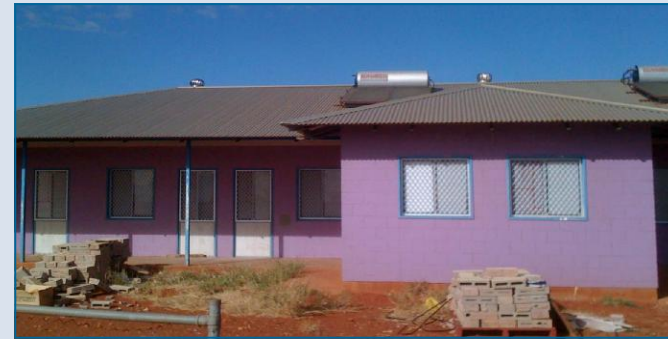
The Purple House at Kintore