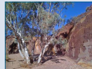
Ochre pits (left)