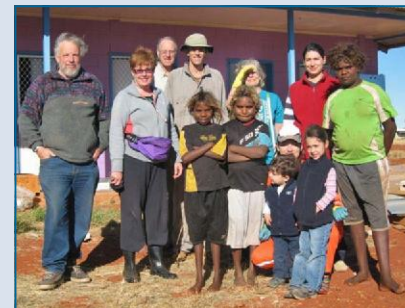
Team members with some locals (left)

for the Rotary Western Desert Project. Congratulations us. The club was also mentioned in a number of speeches, and performed very well in the attendance category.