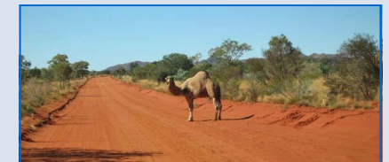
Roadside hazards (right)