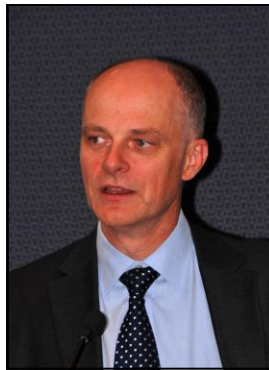
Dr Frank Bowden

He referred to a number of other serious infectious diseases. A vaccine was developed for Hepatitis B in the 1980s and today every child in Australia is vaccinated. Hepatitis C was not identified until 1989. It is spread by injecting drug users and contaminated blood products. It poses an enormous threat to health of Australians and currently there is no vaccine available.