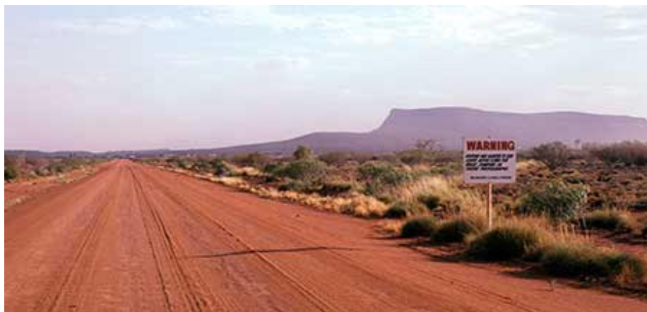
Arriving in Walungurru or Kintore, at the base of Pulikatjara hill and 530 km west of Alice Spring.

There are seven outstations, serviced by the council, with populations between 4 and 15. One of these, Ngutjul, is situated next to a dramatic set of red hills, a site of ceremonial significance and a good illustration of the label “The Red Centre”. A family of 12 lives nearby. The road continues south west from Sandy Blight Junction near Walungurru to cross into Western Australia, linking up with the “Gunbarrel Highway”, which used to be the first link between Western Australia and Central Australia. The rough red gravel road, after about 300 km, then doubles back into the Territory to Kaltukatjara (Docker River).