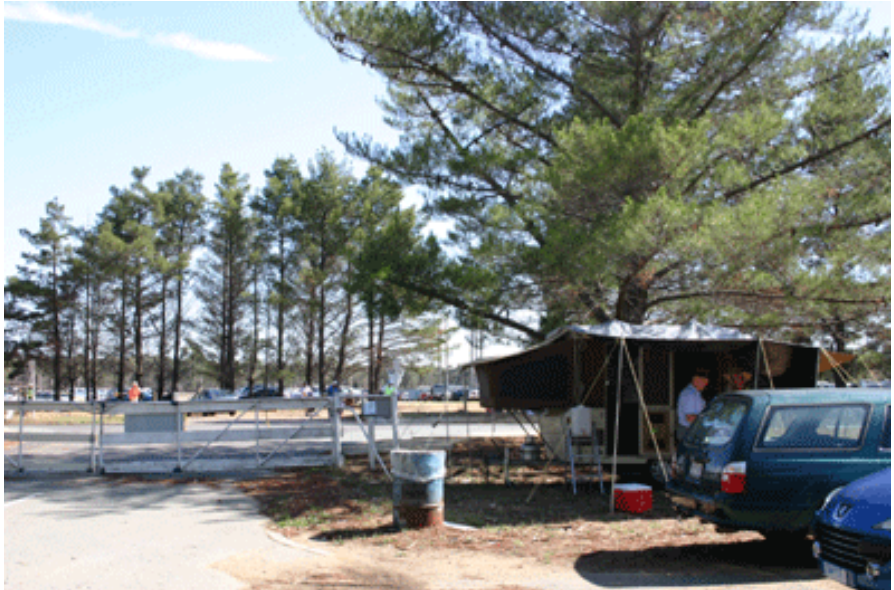
Setting the Scene