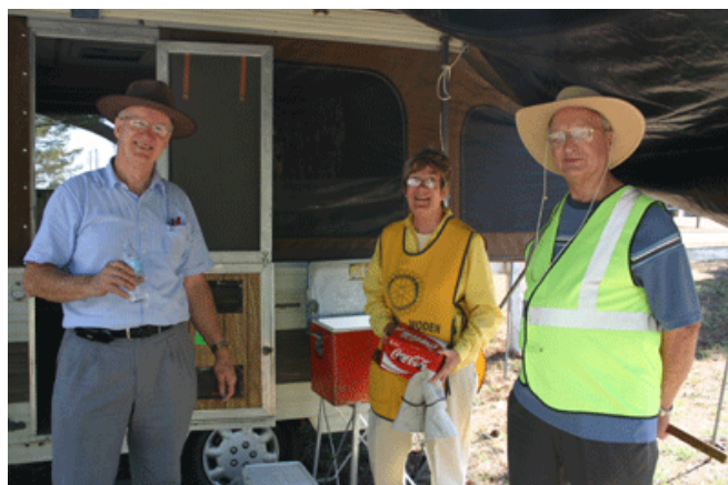
Time for a rest,