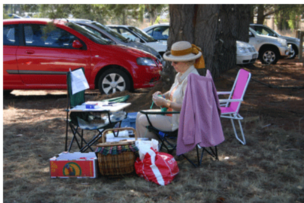
and Time for some knitting!