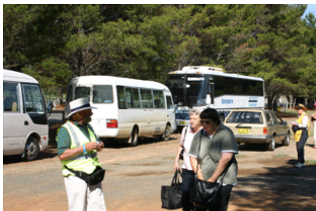
Time for a chat,