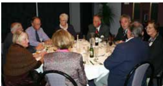
One of four happy tables of members and guests at the CIT School of Hospitality

Clubs this year will be $875, a small increase from last year. The next meeting will be 8 May.