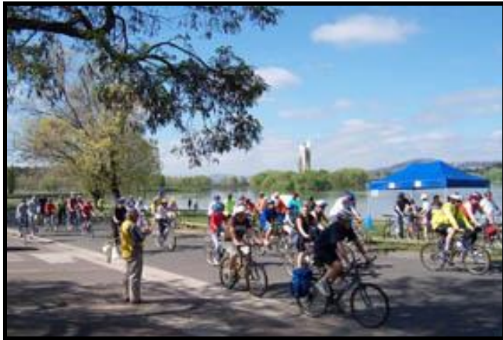
A Canberra Woden Rotary Project