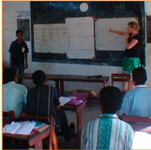
Often classes have to be suspended while teachers are being trained

A dedicated Teacher Training & Resource Centre will allow Catholic Education to increase their teacher training efforts and provide local teachers access to teaching aids and