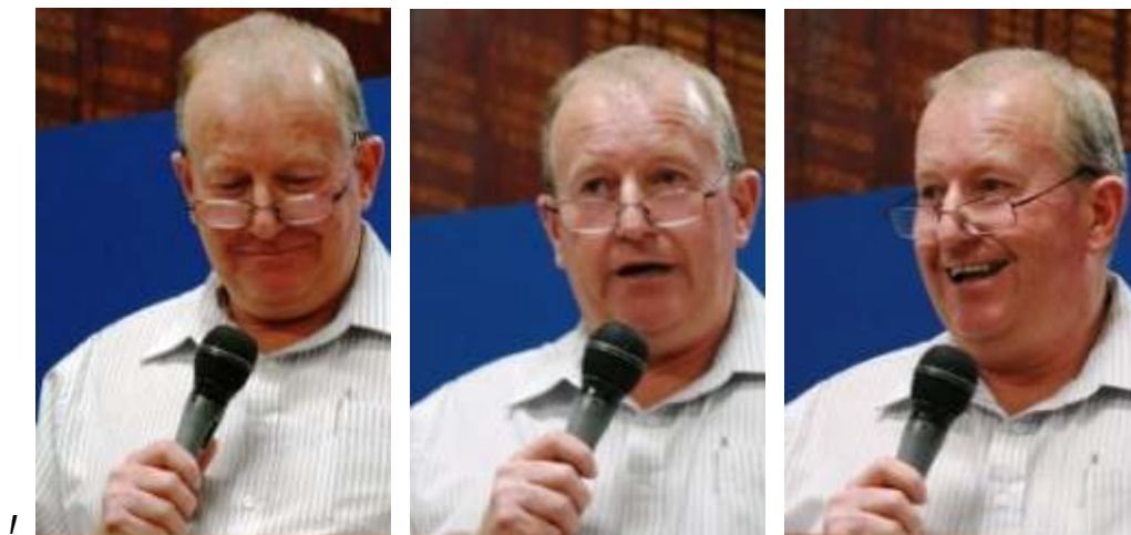
It's all in the timing

We learned too of wool classing and the techno approach to assessing fine fibre.