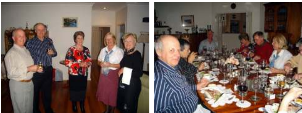
Some of us are still uncertain about the hump in the loungeroom.

Perhaps there are others ready to host for this wonderful cause? Contact Valda.