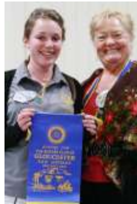
Whakatane - Gloucester Rotary Pennants exchanged