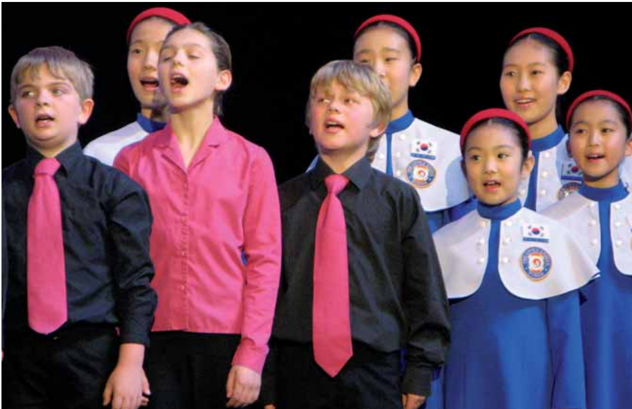
A children's choir comprised of singers from Britain and Korea proved a moving feature of the East Meets West entertainment theme.

all of which opened the way for an exciting “East meets West” theme.