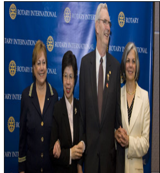
Representatives of the four spearheading partners of the Global Polio Eradication Initiative addressed RI Convention attendees and the media on Tuesday, June 17.

World Health Organization (WHO) Director-General (DG) Dr Margaret Chan has made polio eradication the agency's 'top operational priority' during her keynote speech at the Rotary International Convention in Los Angeles this month. Read more.