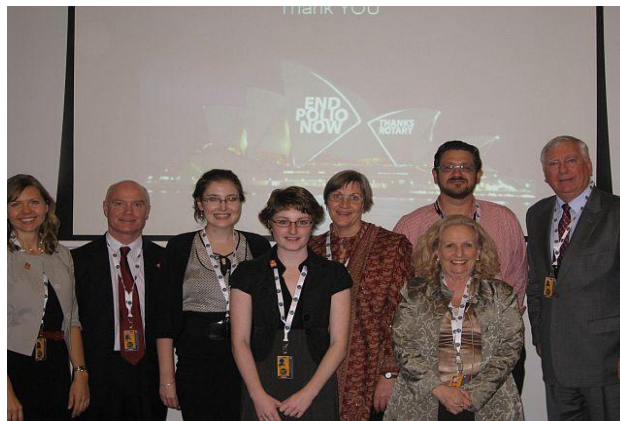
The Polio Eradication team from the UN Summit

It was nice to be home briefly in Sept to see my mom and to share our polio story at the UN Dept Public Information NGO Summit on Advancing Global Health in Melbourne. At this summit Rotary's workshop was titled "Coordination of a Public-Private Health Campaign- The Polio Eradication Initiative". The Summit gave us the opportunity to meet many other NGOs who are working to improve the lives of many around the globe and share ideas. It is always a privilege to share stories of the field battle towards polio eradication, it is an amazing program achieving much more than just our polio focus.