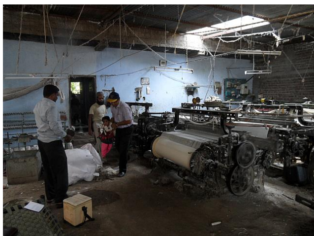
Immunizing in a power loom

languages are Marathi, Urdu, Hindi and to a lesser degree English. The city has grown around its textile industry and is famous for its power looms. The noise of these looms is deafening, but they are the character of Malegaon, as is the lack of infrastructure to support the population. Many areas lack the basics of drinking water and sanitation; this contributing to the persistence of polio virus in the area. I was truly happy to be posted here.