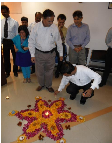
Lights around a rangola in the office

Time just flies when one is totally consumed in pursuing what they feel passionate about, it is hard to believe it is December already. The festivals have come and gone. Diwali - the festival of light - a time of thanksgiving for the harvest and having many traditions from India's mythology. At the office we lit lamps around a flower rangola (colourful mosaic on the floor)) then all joined for a meal together. The light of the lamp symbolising peace and harmony. The festival was an incredible experience, we had several nights of fireworks, shopping and celebrating with family.