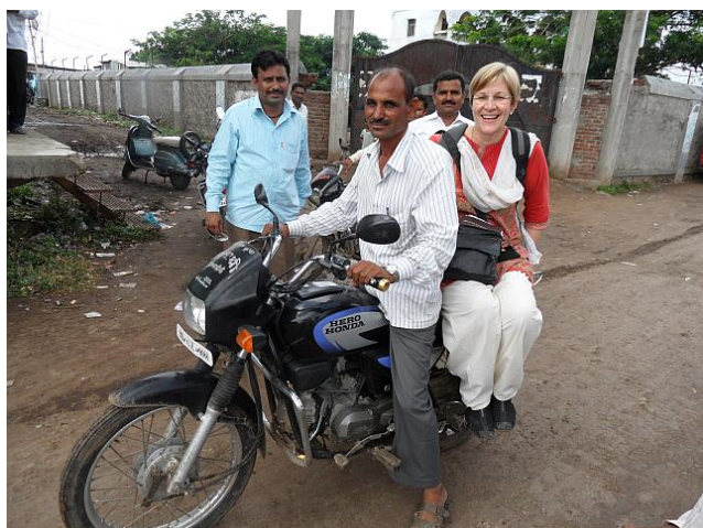
Transport to town

It is truly a honour to be serving with polio eradication, to walk alongside so many in this program, to live in another culture, to and to meet those most needy in our community.