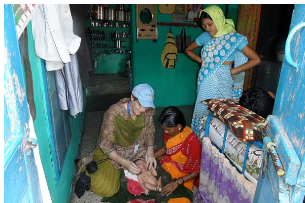
Vaccinating a newborn in my RDU cap

The RC Malegaon also invited me to the felicitation of some community members which was an honour. I actually spend far more time at some rotary clubs here than in my own district.