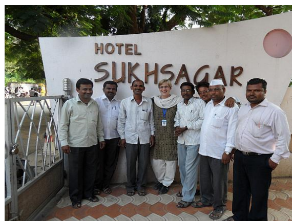
Some of the Malegaon team.