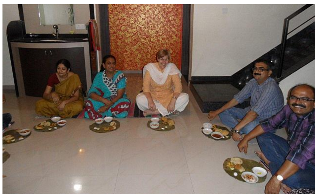
Sharing dinner & Durga Puja RC Malegaon Midtown

Since my return, we have been full on into preparations and implementation of campaigns, so days have been long and I usually crash before dinner at 2200 hours. My home in Malegaon is great, a small hotel where our entire team stay. They have a veg restaurant and really cater to our needs (early mornings and late nights). They know I love spices so my food is usually packed with chilli. The President of Rotary Club of Malegaon Mid Town invited me to join their meeting for the DGs visit which was nice. The meeting was in Marathi (language), - it is really interesting to be introduced prior to speaking and not understand one word that was being said!