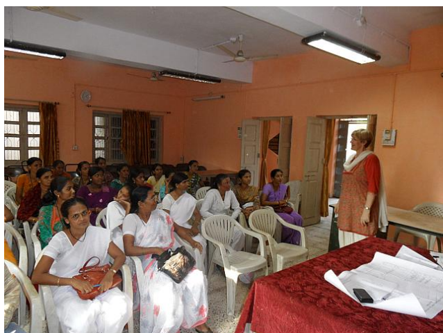
Training supervisors in Malegaon