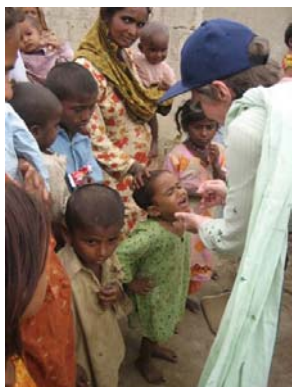
We catch up with the nomad children

We are at a vital point in the program and have to interrupt virus circulation here this year. Our real test lies ahead in the coming months, as we enter the peak season when virus spreads more readily. But we must win this war....and do it now.