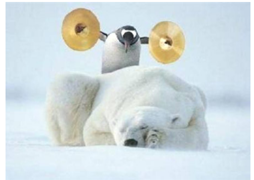
Look out for those pesky penguins