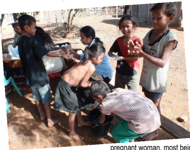
Above: SISCa clinic at Moleana (a village in Maliana Sub-district)