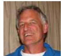
Benetook Veterinary Clinic