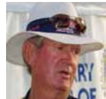
John Vann Plumbing