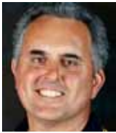
Sunraysia's Happy Handiman