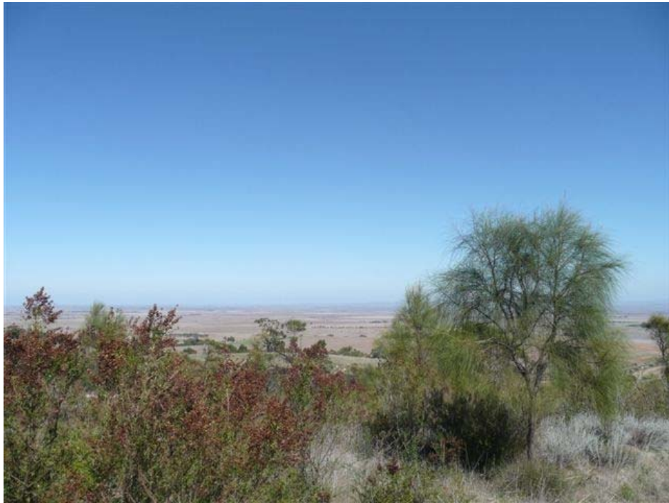
Scene from Brooks Lookout near Clare on the club trip