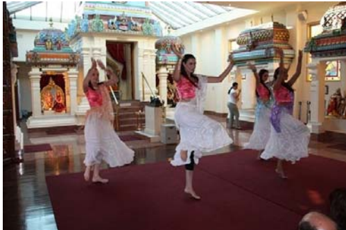
Dancers entertain us during the Temple Visit