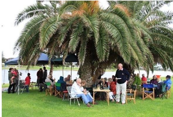
A group of breakfasters shelter under a palm tree

We hold Breakfast on the Pat around February/March when it is very unlikely we will have bad weather and for years this has worked. 2011 turned out to be the rare occasion when just before the breakfast commenced, it poured with rain. Fortunately the rain did not last long and many of the people coming had already left home, so although attendance was down, it did not make a huge difference.