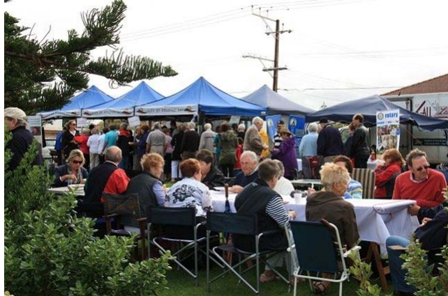
Some of the crowd at Breakfast on the Pat