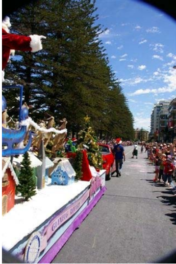
Christmas Float in the Glenelg Pageant