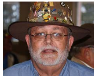
Rotary Health "HATS DAY" was supported with a wonderful array of hats