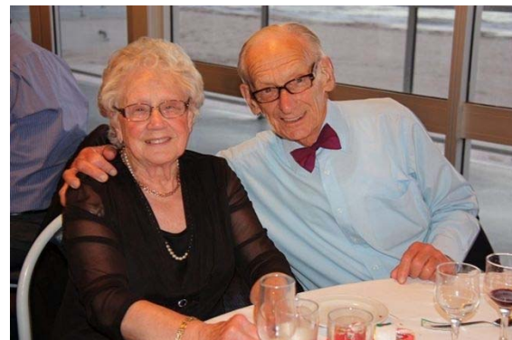
Club Members enjoying Christmas Dinner at Brighton & Seacliff Yacht Club