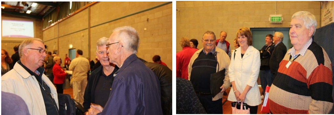
Some members of next year's Board chatting at the Waikerie District Conference