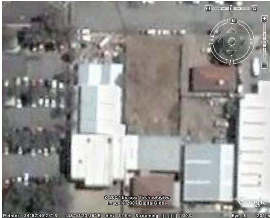
Satellite View of the Club Shed, Benjamin Street

satellite into orbit. It is amazing to realize that there are something like 4,000 satellites in orbit at present. The presentation concluded with examples of some of the satellite imagery available, including shots of the Athelstone Football Clubrooms and our Rotary Shed in Benjamin Street.