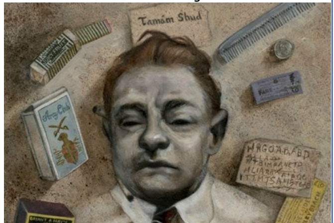
The various pieces of the mystery, including the code