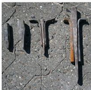
Plug and feather