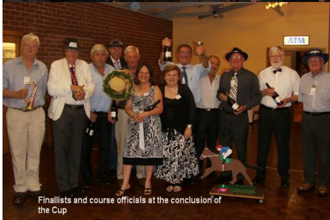
Finalists and course officials at the conclusion of the Cup